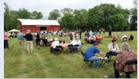
More than 240 supporters of HomeAid Northern Virginia enjoyed the 2015 Builders & Friends BBQ and raised $40,000 to support HomeAid's mission.

For registration/sponsorship information and more, please visit www.homeaidnova.org/news-events/bbq/ .