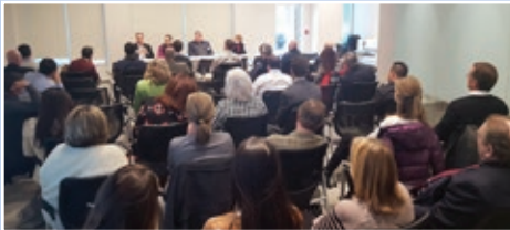
A panel of leading industry sales and marketing professionals shared their insights with a packed room of their colleagues.

Plans are also underway for the council’s Builder-Broker Roundtable, to be held at The Kilner Group’s new building space in Fairfax in September, and a Design Trends Conference to wrap up the year in December that will feature experts who will discuss architectural, green building and interior design products that shaped the year.