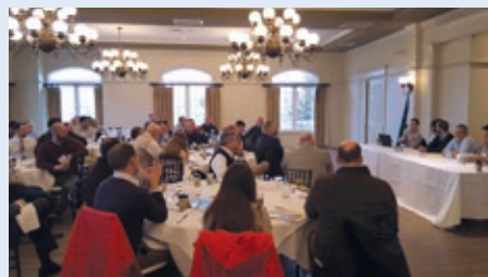
In February, a panel of NVBIA Members who are environmental consultants briefed the Prince William Chapter on current pressing issues during their chapter breakfast.

Members are actively involved with proposed changes to underground utility requirements, which may move from the County's zoning ordinance to the Design